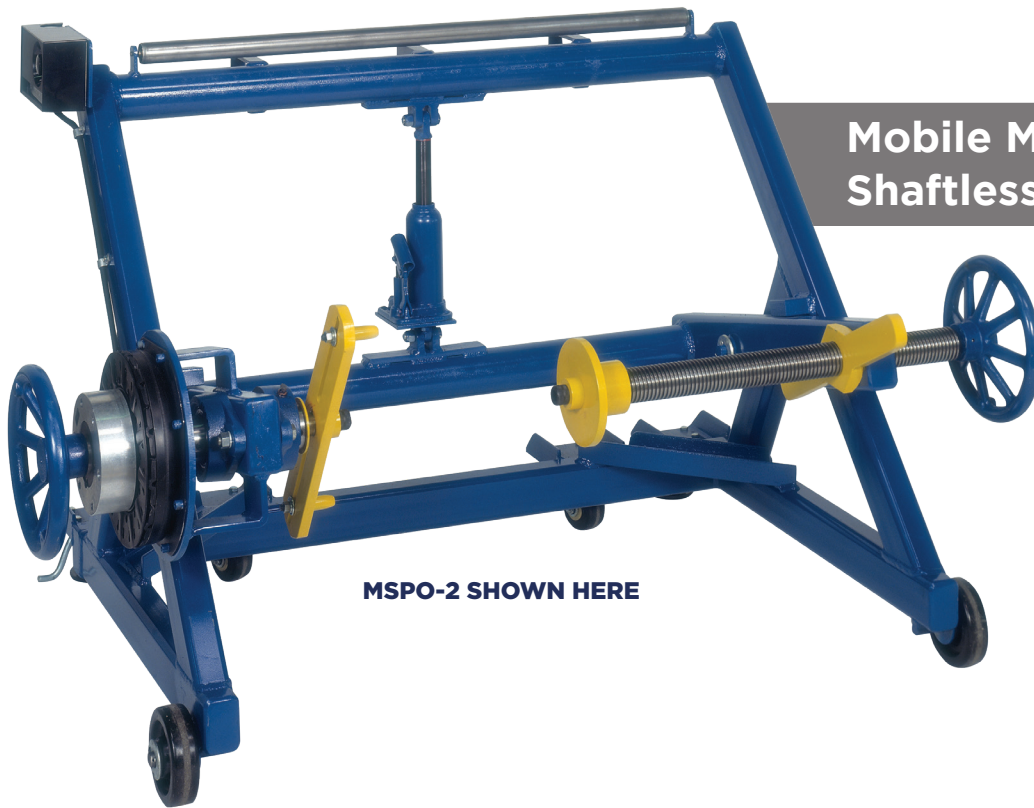
Mobile Manual Shaftless Payout