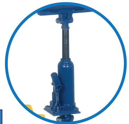
MANUAL HYDRAULIC LIFT